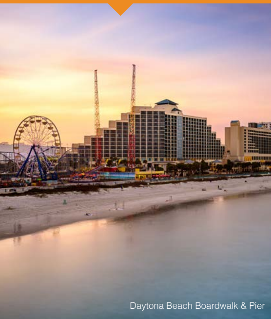
Daytona Beach Boardwalk & Pier

Charlie Horse Cruisin Café Don Peppers Mexican Grill Genovese's Italian Café HiBachi Express Hull's Sea Kitchen Larry's Giant Subs Lulu's RipTides Ronin Sushi & Safe Bar Stavro's IV Thai Erawan Thai Restaurant